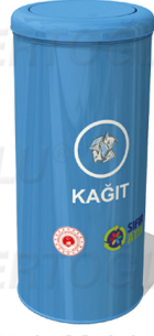
Mak-661b/ Single-Tekli/Powder Coated-Boyalı Ø:31xh:70 cm 50 L