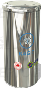
Mak-661a/ Single-Tekli/Stainless-Paslanmaz Ø:31xh:70 cm 50 L