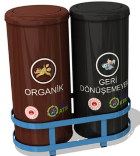
Mak-661b/ 64x32,5x74 cm 2 Units/İkili