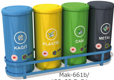
Mak-661b/ 128x32,5x74 cm 4 Units/Dörtlü