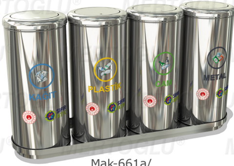
Mak-661a/ 128x32,5x74 cm 4 Units/Dörtlü Stainless Steel Frame/Paslanmaz Bazalı