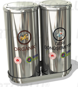
Mak-661a/ 64x32,5x74 cm 2 Units/İkili Stainless Steel Frame/Paslanmaz Bazalı